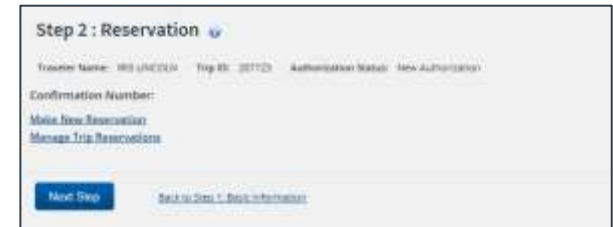
Figure 3: Authorization Reservation – No reservations