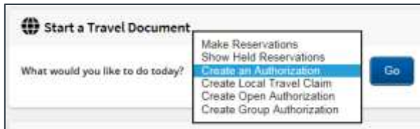
Figure 1: Start a Travel Document — Create an Authorization option