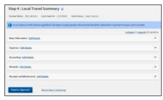
Figure 3: Local Travel Summary page

The Summary page displays your local travel claim information.