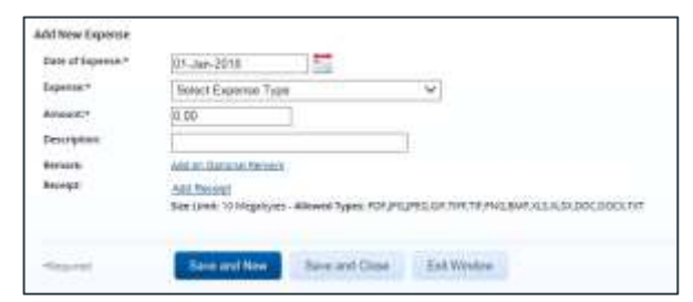
Figure 2: Local Travel Claim — Add New Expense

Click the Add New Expense link. This displays the Add New Expense window.