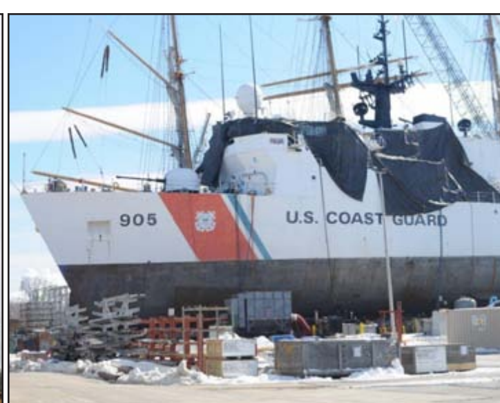
CGC SPENCER (WMEC 905) - Boston, MA