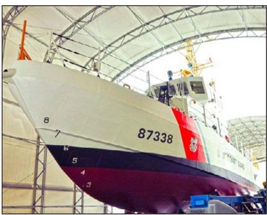
CGC IBIS

The 87' bow-to-stern initiative is a $49 million, 4-year recurring maintenance for the Coast Guard Atlantic Area 87' coastal patrol boat fleet. The program boosts the predictability of fleet operational schedules, eases personnel tempo by having crews drop off their cutter for repair and transit home with a completed replacement boat. The project intends to save the Coast Guard $2.2 million annually with no reduction in fleet operational hours. The Yard See Patrol Boat, pg 5