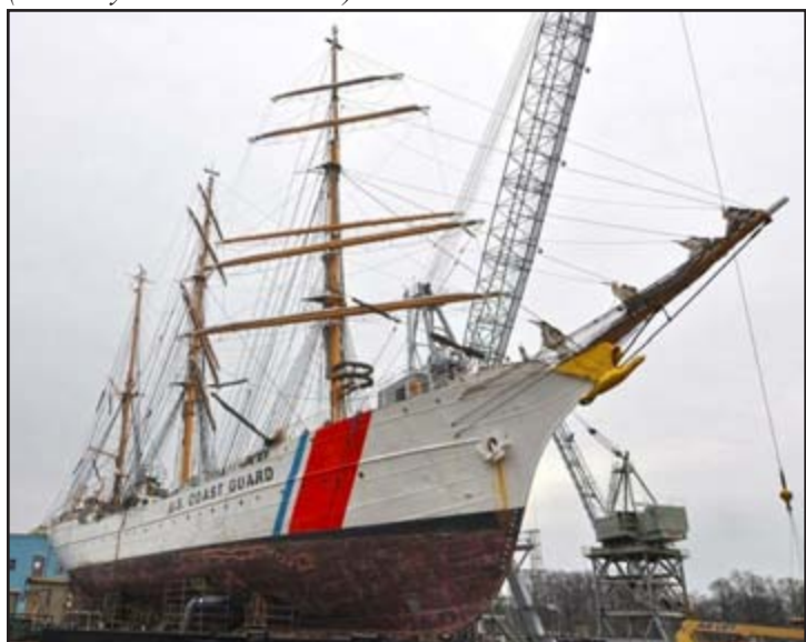
CGC EAGLE (WIX 327) - Baltimore, MD