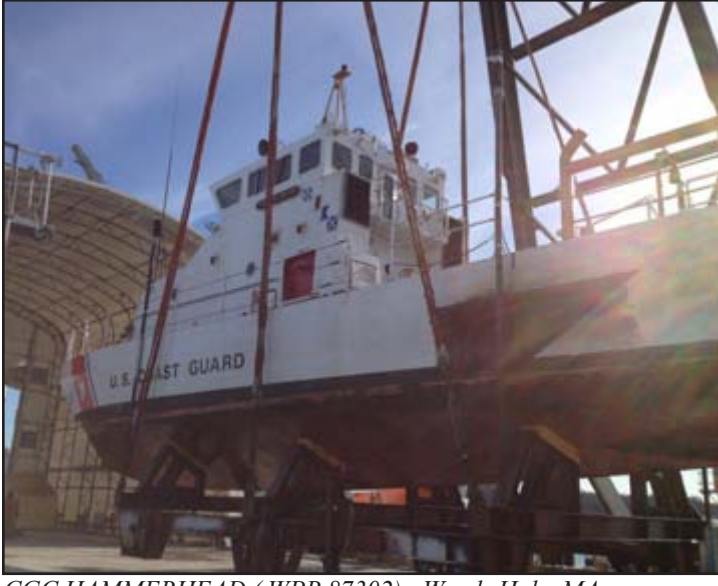
CGC HAMMERHEAD (WPB 87302) - Woods Hole, MA