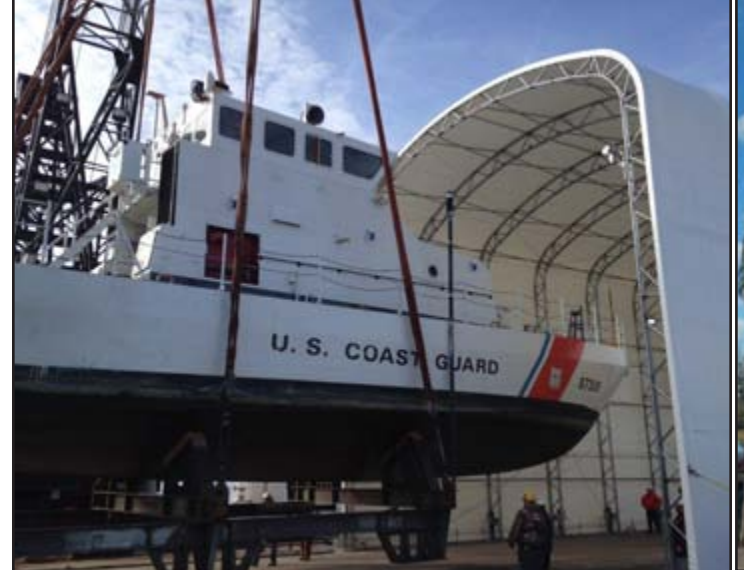
CGC STINGRAY (WPB 87305) - Mobile, AL