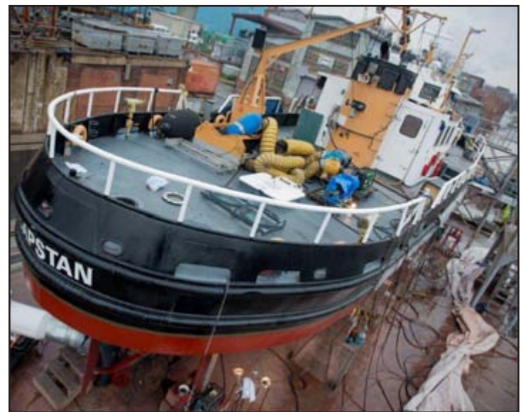
CGC CAPSTAN (WYTL 65601) - Philadelphia, PA