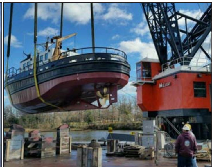
CGC HAWSER (WYTL 65610) - Bayonne, NJ