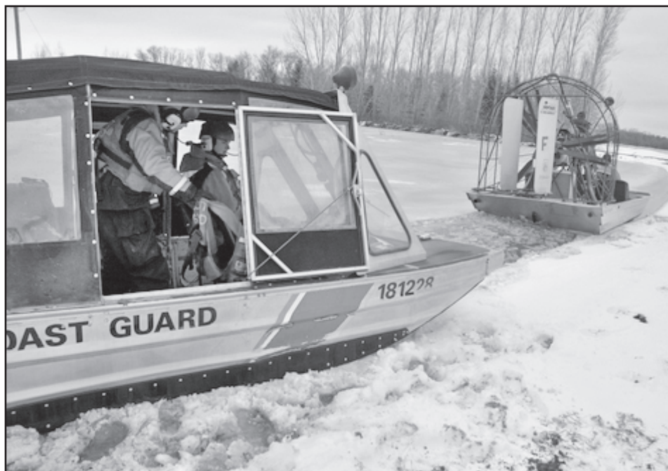
Two airboat crews get underway on a safety patrol for residents who were stranded during late winter flooding and freezing in Fargo, North Dakota.

An airboat's handling characteristics challenges many coxswains due to the diversity of terrains and missions the platform is used on. But before a