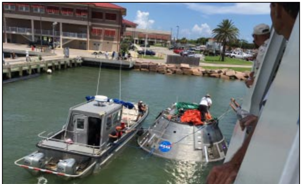
The HARRY CLAIBORNE crew assists NASA technicians during testing of a space capsule retrieval.