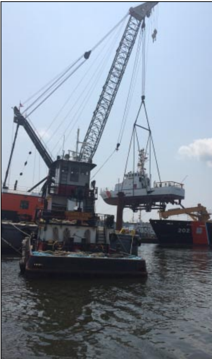
CGC SAILFISH (WPB 87356) - Highlands, NJ