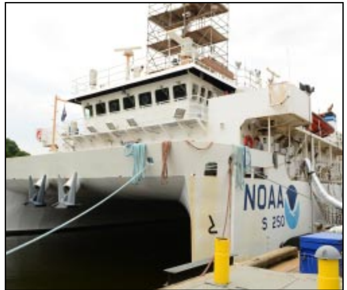
NOAA Ship FERDINAND R. HASSLER - New Castle, NH