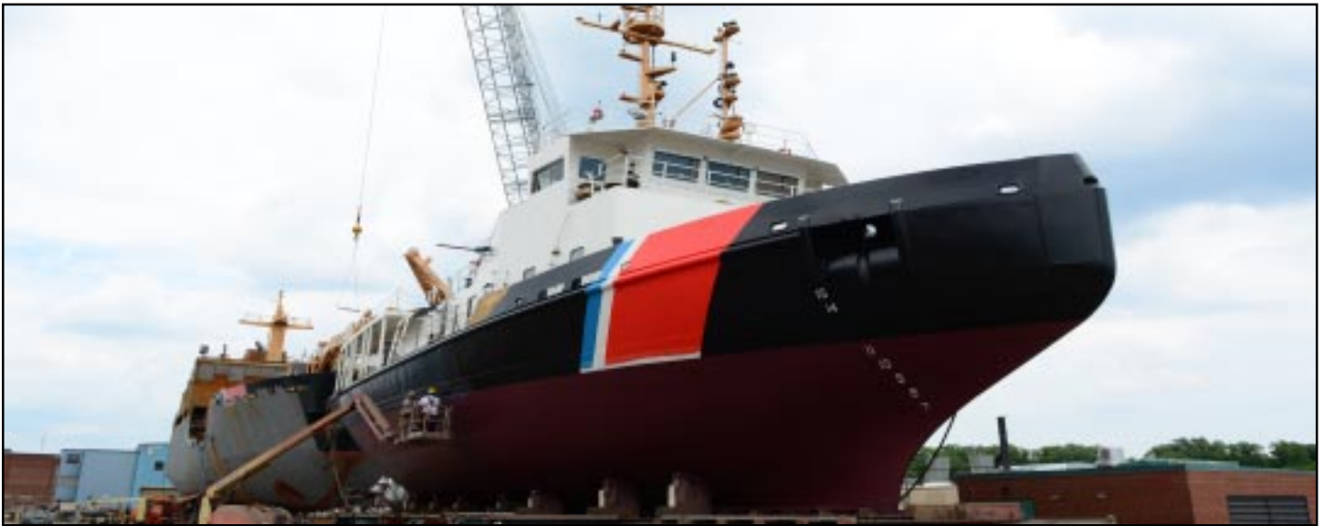
CGC KUKUI (WLB 203) (left) - Honolulu, HI; CGC STURGEON BAY (WTGB 109) (right) - Bayonne, NJ