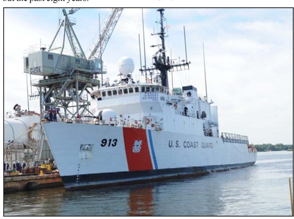
Cutter MOHAWK pulls into port at the Yard

MOHAWK's MEP is anticipated to span 11 months, finishing up in July 2014.