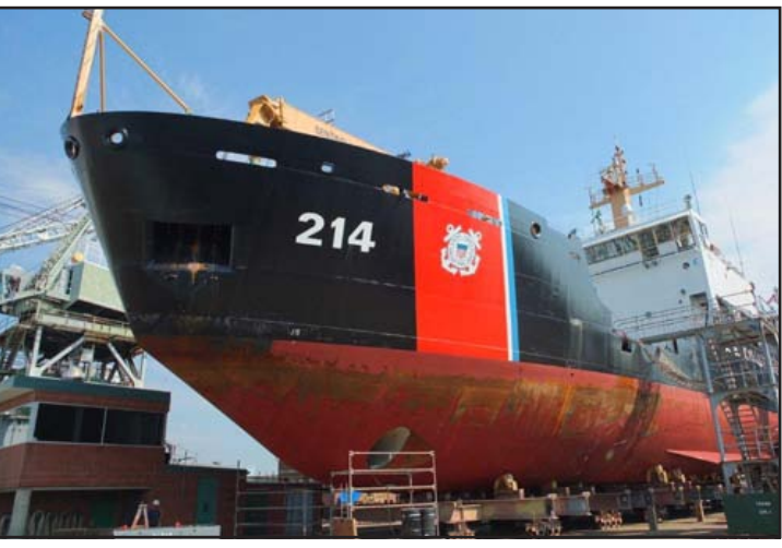
CGC HOLLYHOCK (WLB 214) - Port Huron, Michigan