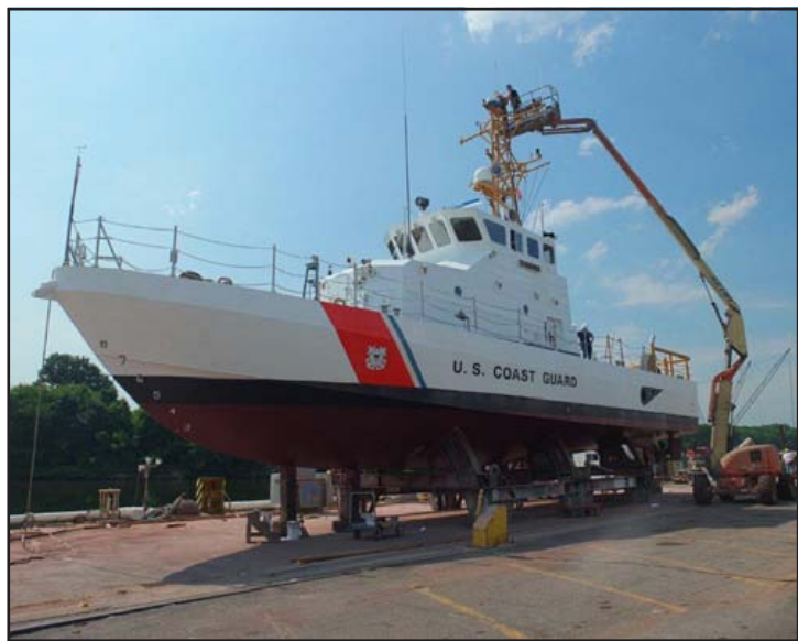
CGC BELUGA (WPB 87325) – Virginia Beach, Virginia