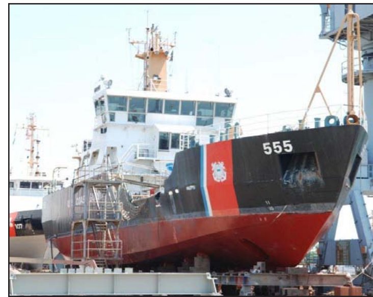
CGC JAMES RANKIN (WLM 555) – Baltimore, Maryland