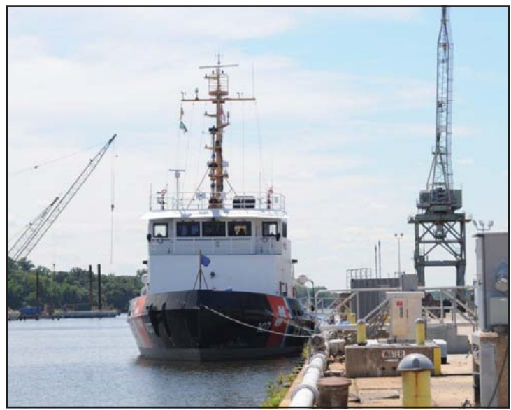
CGC PENOBSCOT BAY (WTGB 107) – Bayonne, New Jersey