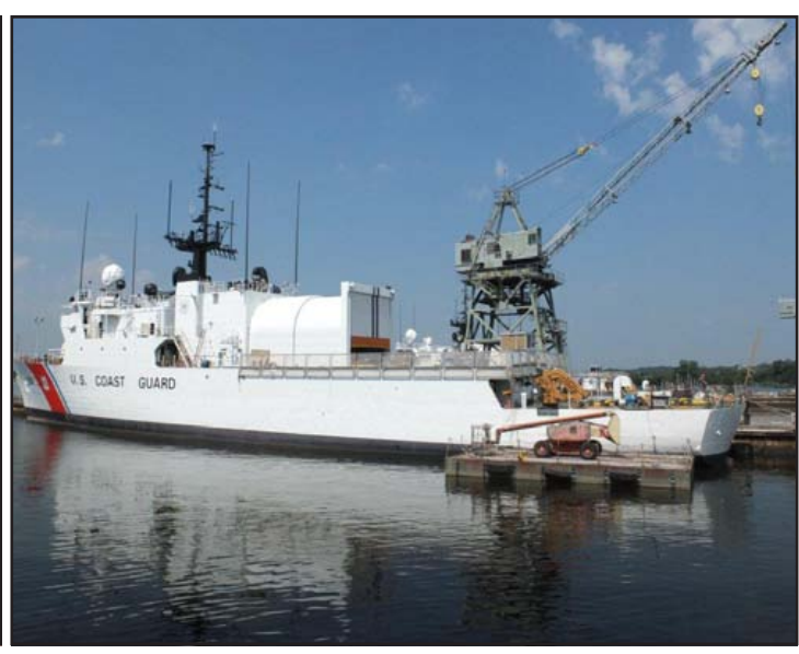
CGC CAMPBELL (WMEC 909) – Portsmouth, New Hampshire