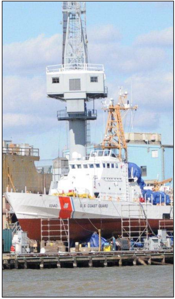
The 110' patrol boat JEFFERSON ISLAND docks on the Yard's shiplift in January 2013 to undergo critical repairs.

Over the course of the past five months, you and your shop personnel not only repaired the disabling effects of the runaway electrolysis and the removal and re-installation of the associated interferences including both shafts, propellers, rudders, stabilizer fins, main diesel engines, ship's service diesel generators, all of aft berthing, and much of the aft head, but you also assisted us with many other shipboard work items and performed additional work/troubleshooting on several other shipboard systems