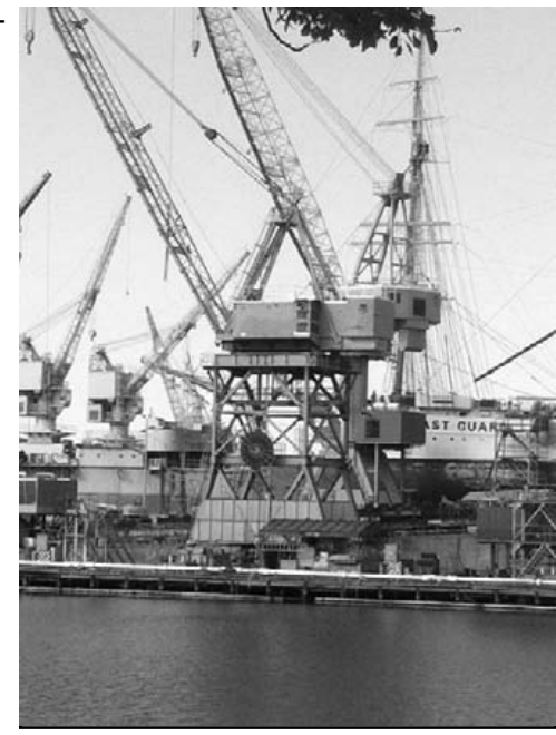
Electricity powered Tower Crane #5 with the Coast Guard Cutter EAGLE in the background.

The electrification of Tower Crane #1, the second conversion project, is already underway with planned completion during the summer of 2012.