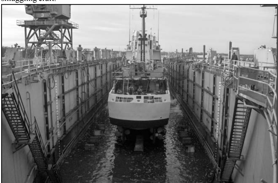
Coast Guard Cutter DEPENDABLE in dry-dock during its Mission Effectiveness Project in 2006.

The press release at right is authored by the Fifth Coast Guard District Office of Public Affairs: