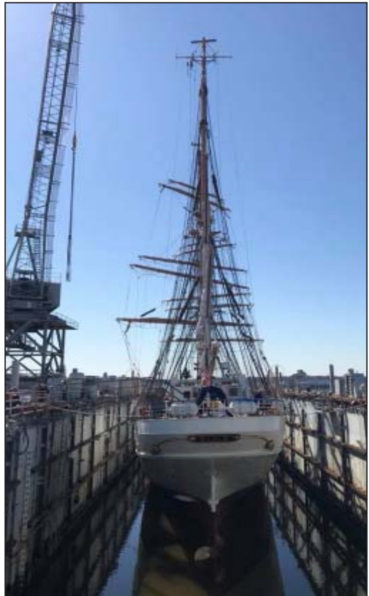
EAGLE departs OAKRIDGE as the Coast Guard's training vessel gets ready to conclude a 4-year modernization at the Yard and prepare for the 2018 summer ports of call.

The Yard has been EAGLE's homeport throughout the four-year SLEP and, upon the tall ship's departure, wishes its officers and crew "Fair Winds and Following Seas."