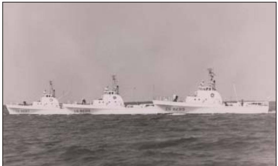
Three Yard constructed 82’ patrol boats (left to right) - CG 82317, CG 82316, and CG 82315 - departed in June 1961 as part of Coast Guard Patrol Squadron One that served with distinction in the Vietnam War.