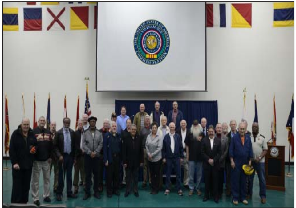
A representative group of attending Vietnam War era veterans joined together for a photo at the conclusion of the National Remembrance Ceremony held at the Yard on March 29 th .