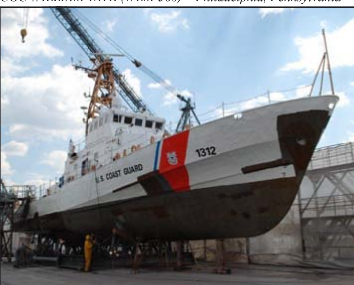
CGC SANIBEL (WPB 1312) – Woods Hole, Massachusetts