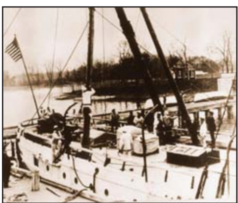
The Revenue Cutter Service Class of Cadets of 1905 at the Yard