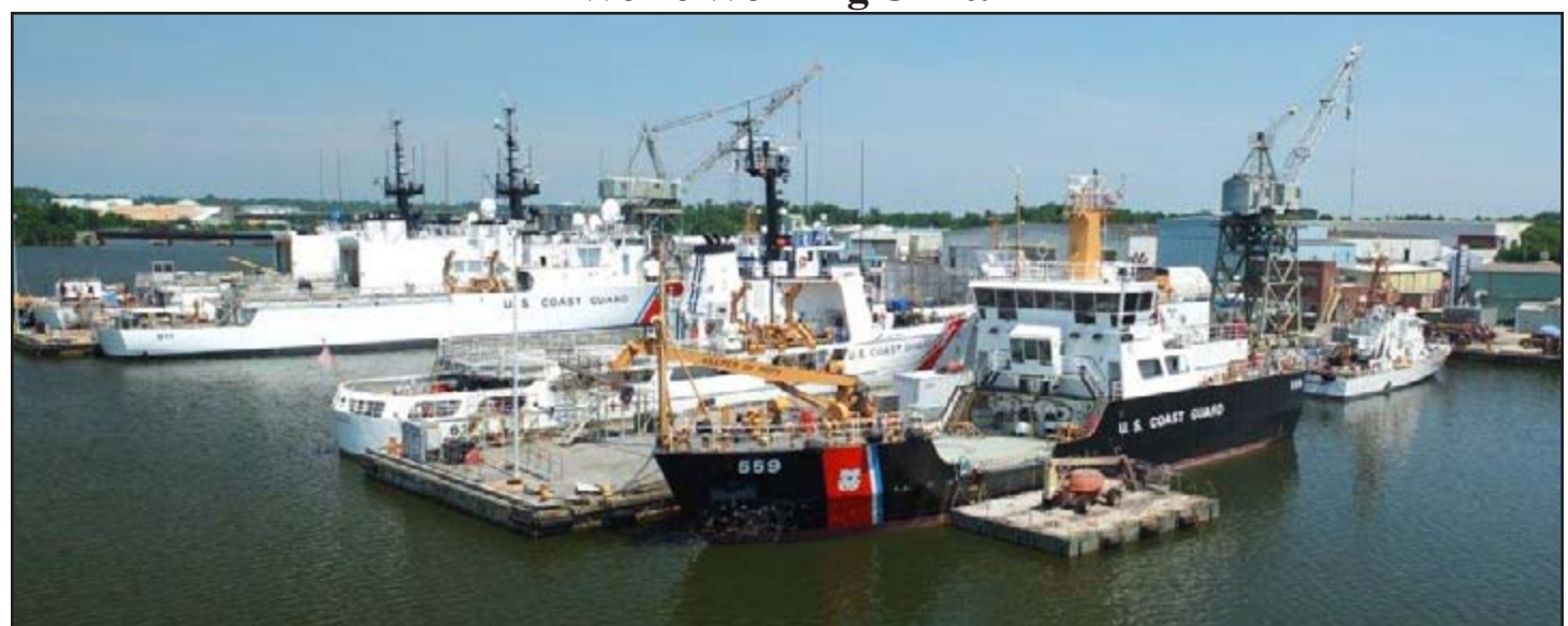
Pictured counter-clockwise: CGC BARBARA MABRITY (WLM 559) – Mobile, Alabama; CGC OCRACOKE (WPB 1307) – St. Petersburg, Florida; CGC DILIGENCE (WMEC 616) - Wilmington, North Carolina; CGC FORWARD (WMEC 911) - Portsmouth, Virginia; CGC MOHAWK (WMEC 913) – Key West, Florida