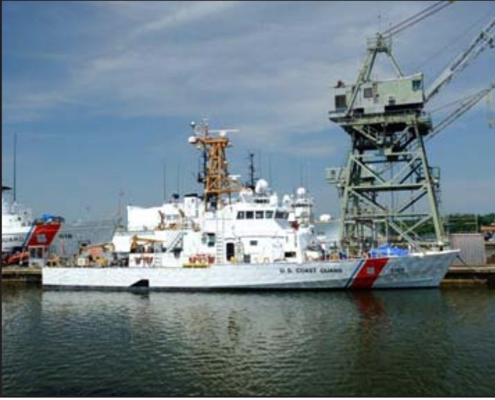
CGC OCRACOKE (WPB 1307) – St. Petersburg, Florida