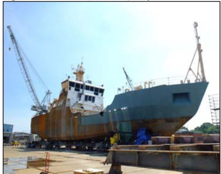
CGC WILLIAM TATE (WLM 560) - Philadelphia, Pennsylvania