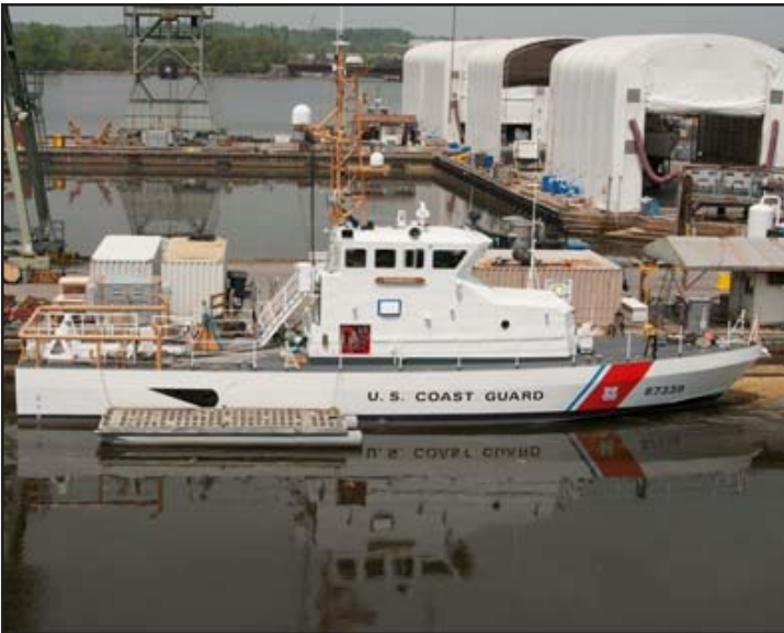
CGC POMPANO (WPB 87339) - Sabine Pass, TX