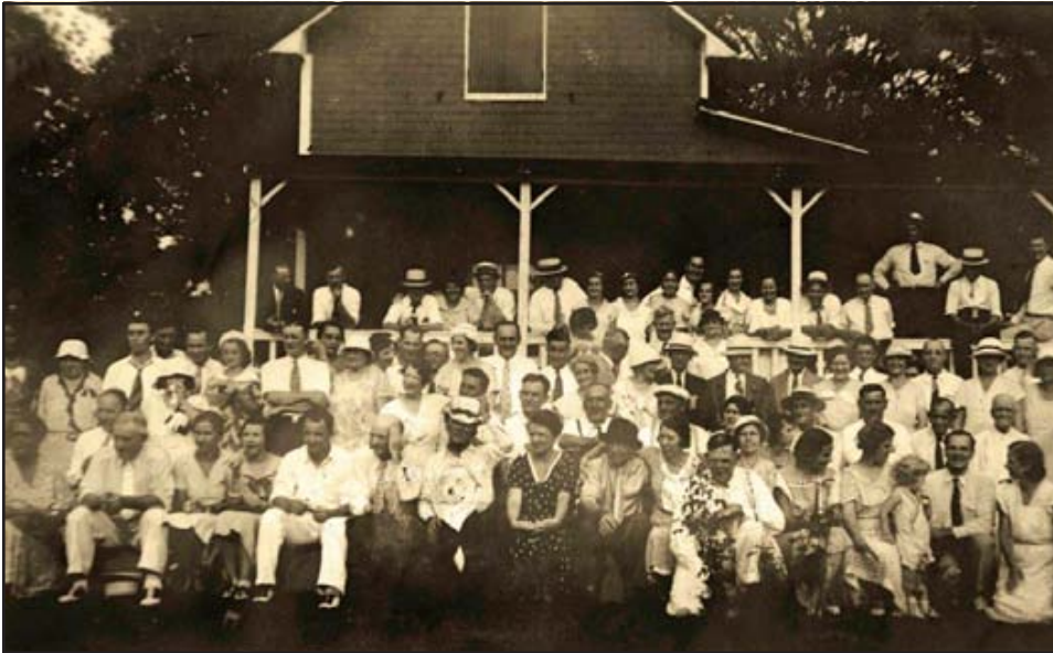
Coast Guard Yard Picnic 1932

below) started as a tradition and has continued for over 80 years. Although what picnic goers wear has certainly changed, the fun and enjoyment of the yearly summer Coast Guard Day picnic remains. Join us!