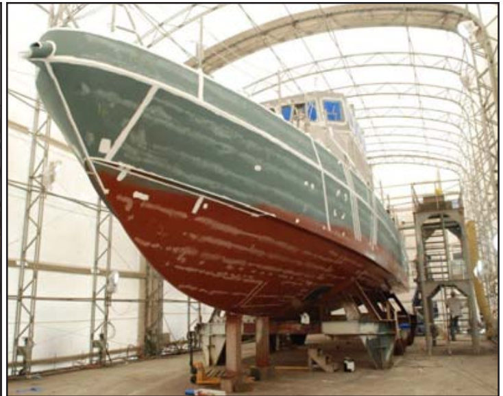
CGC HERON (WPB 87344) - Virginia Beach, VA