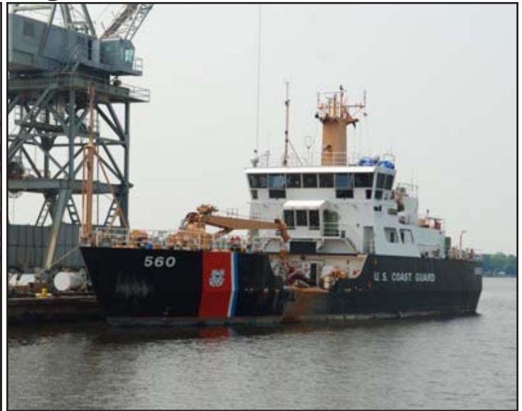
CGC WILLIAM TATE (WLM 560) - Philadelphia, PA