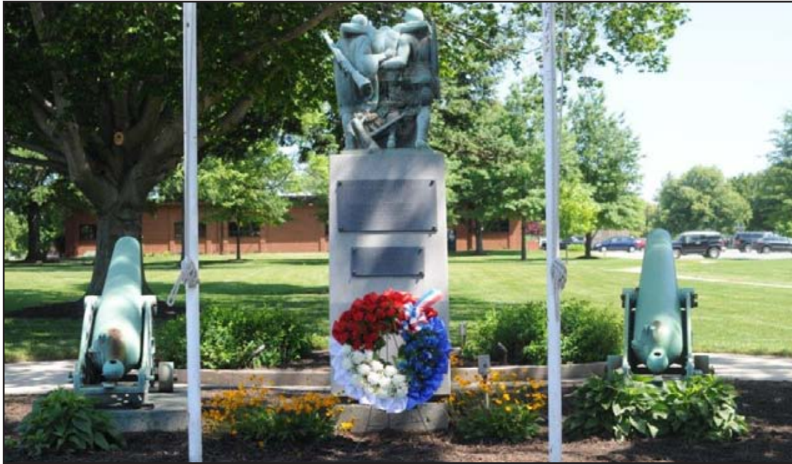
Yard Veterans Monument on Memorial Day 2015

The Baltimore Area Coast Guard commands held the annual Memorial Day Service on Friday, May 22 nd at the Yard Veterans Monument on the parade field. This year's all-hands event commemorated the theme of the 40 th anniversary of the end of the Vietnam War.