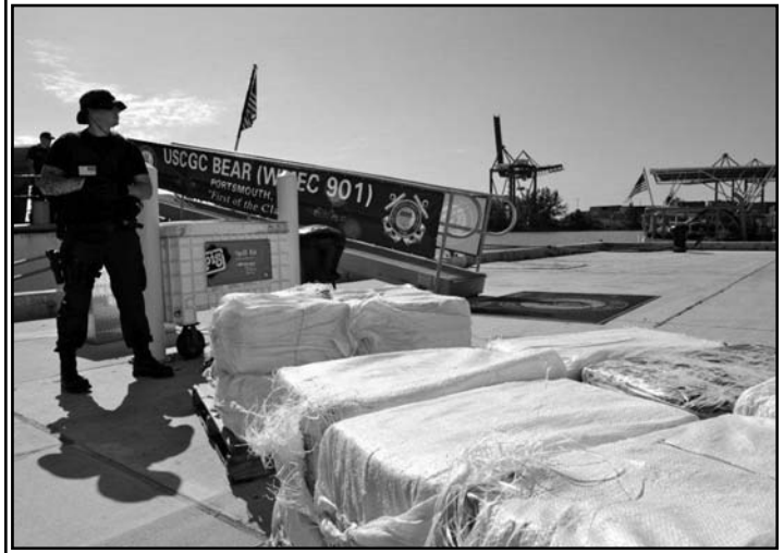
ME3 Tim Suraci, crew member of CGC BEAR, stands watch during an off-load of cocaine at Coast Guard Base Miami Beach, Florida, following the Cutter's drug bust in the Caribbean Sea.

The interdiction was carried out as part of Operation Martillo, a partnering nation effort targeting illicit trafficking coastal routes along Central America. More than 80% of cocaine destined for U.S. markets is transported via these sea lanes. Fourteen countries participate in the Operation including the United States, Belize, Canada, Colombia, Costa Rica, El Salvador, France, Guatemala, Honduras, Netherlands, Nicaragua, Panama, Spain, and the United Kingdom. In 2011, international and cooperative efforts resulted in the disruption of 119 metric tons of cocaine, with a wholesale value of $2.35 billion, before the drugs could reach destinations in the United States.