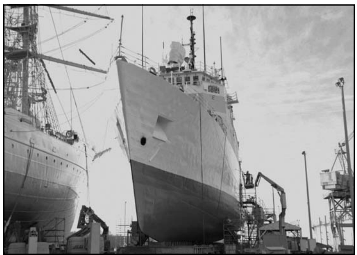
The Cutter BEAR dry-docks on the Yard's shiplift in December 2011 while undergoing the 270' Phase II MEP. BEAR is one of six 270' cutters overhauled at the Yard to date under the modernization project that is designed to replace aging systems on board select ships to improve reliability, reduce operating costs, and meet required mission hours.