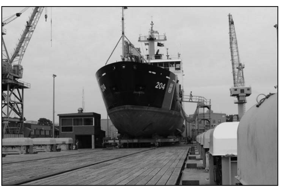
CGC ELM at Yard for routine & emergency repair availabilities