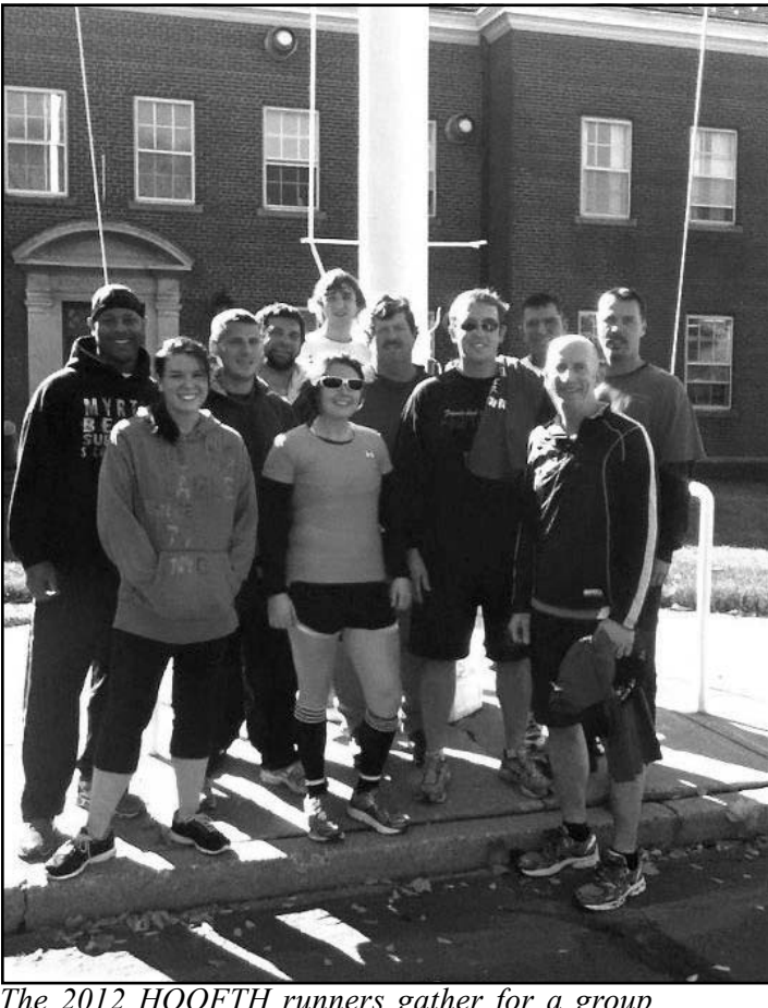
The 2012 HOOFTH runners gather for a group "victory" photo.