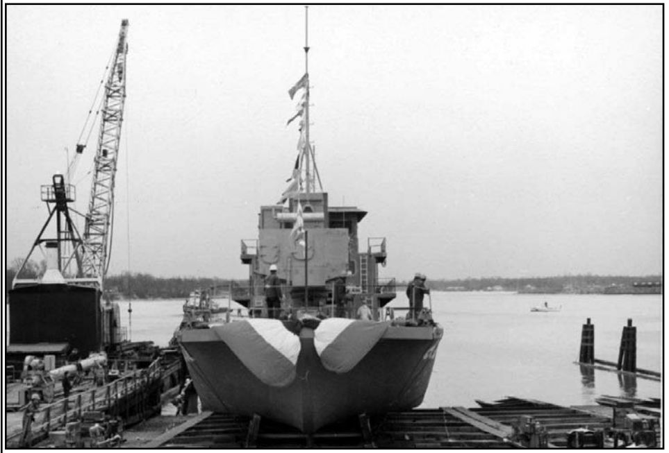
Launching of Coast Guard Cutter KENNEBEC at the Yard on December 11, 1976

KENNEBEC is named after the Kennebec River in Maine. The Cutter's first homeport was Fort Macon, North Carolina, and it relocated in 1980 to its current homeport in Portsmouth, Virginia. Today, KENNEBEC's operating area is