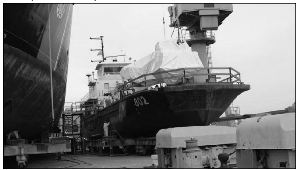
Yard-built CGC KENNEBEC celebrates its 36th birthday on December 11, 2012 while undergoing repair on the shiplift.

package includes inspections and repairs of the propellers, shafts, rudders, sewage piping, and tanks. KENNEBEC will receive extensive