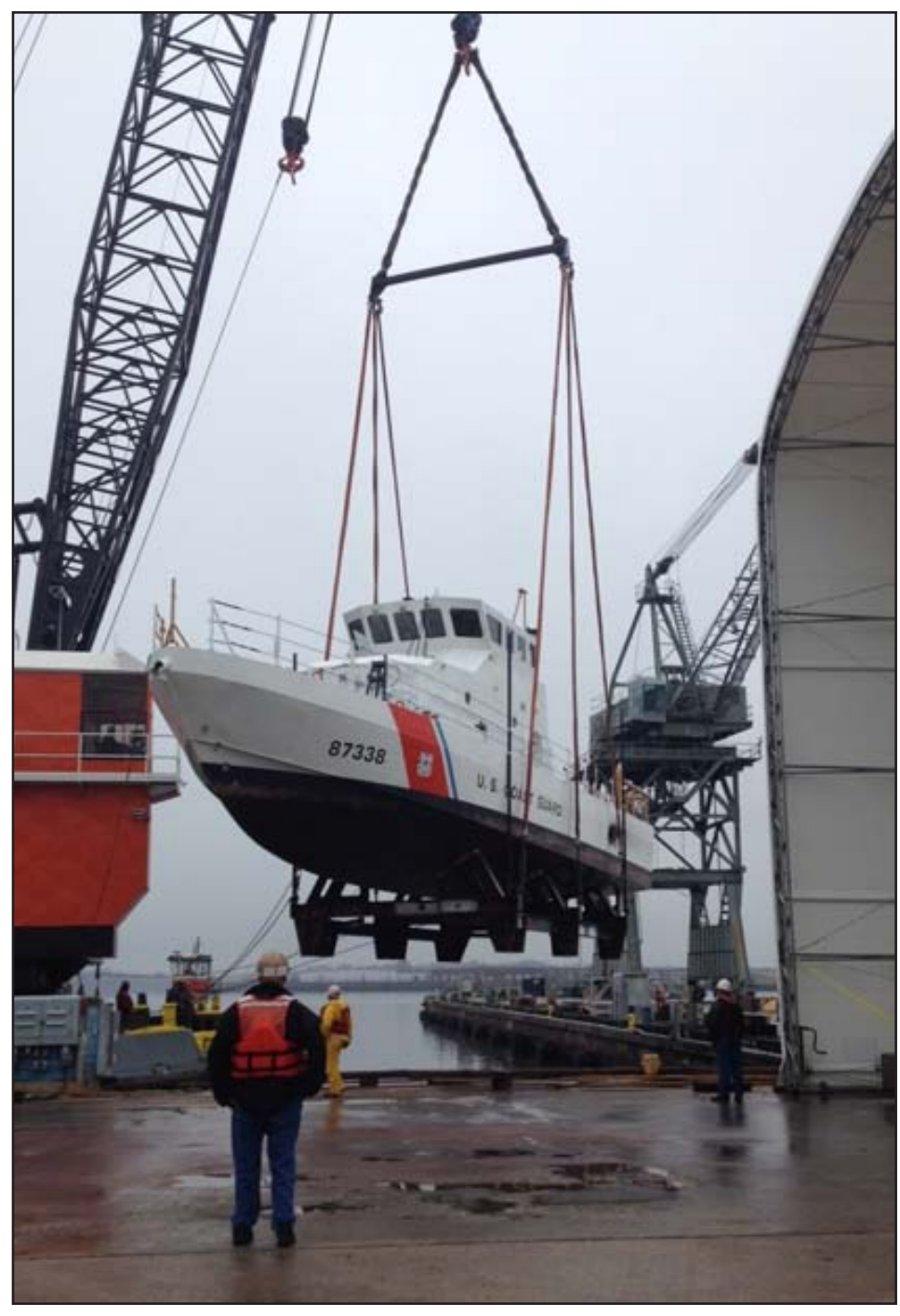
The Yard lifts the 87' patrol boat IBIS, homeported in Cape May, New Jersey, to begin the first 60-day dry-dock availability under the inaugural "Bow-to-Stern" project. The 87' cutters STINGRAY from Mobile, Alabama and HAMMERHEAD from Woods Hole, Massachusetts are next in line for "bow-to-stern" maintenance at the Yard through early spring 2015.