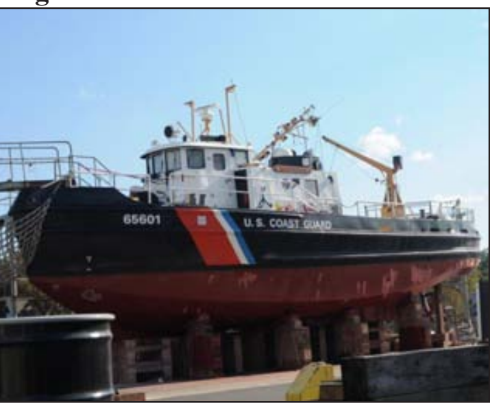
CGC CAPSTAN (WYTL 65601) - Philadelphia, Pennsylvania