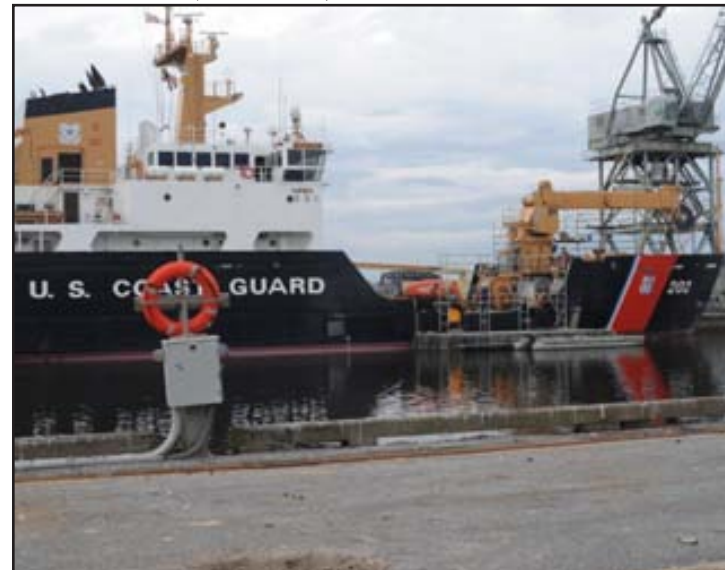
CGC WILLOW (WLB 202) - Newport, Rhode Island