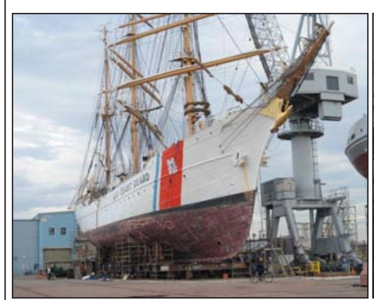
CGC EAGLE (WIX 327) - Baltimore, Maryland