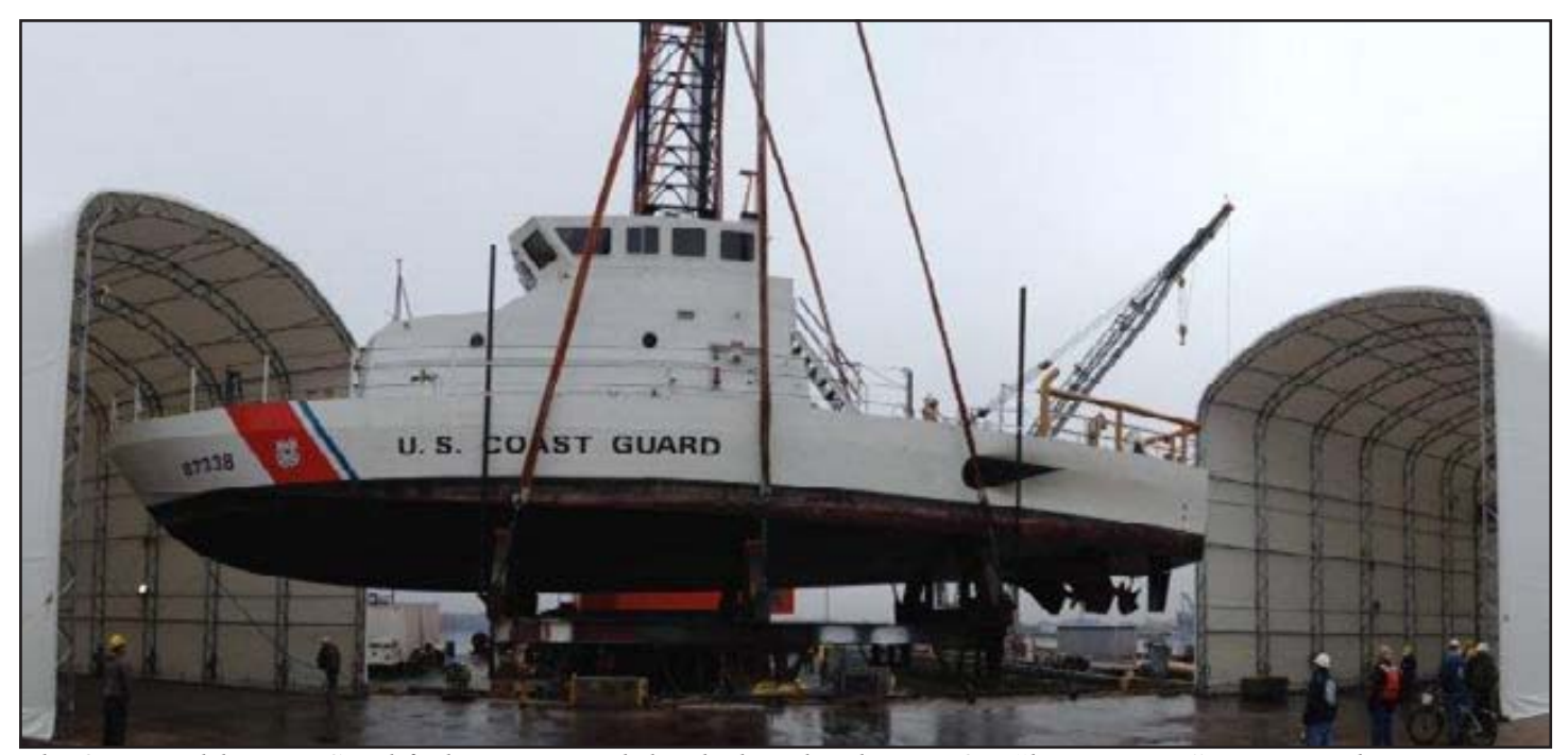
The 87' patrol boat IBIS is lifted into a tented dry-dock under the new 87' "bow-to-stern" project. The program uses a two-piece plastic wrapped scaffolding system for cutter repair, controlling weather conditions to support work schedules. When the boat is in place, two separate scaffold peices join together as one enclosed work space. The Yard has two tented scaffold systems on the waterfront to accommodate simultaneous "bow-to-stern" maintenance.