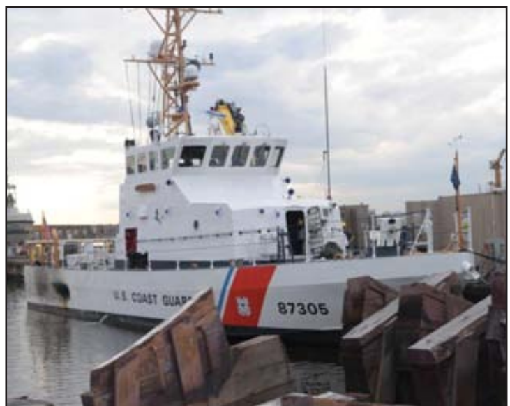
CGC STINGRAY (WPB 87305) - Mobile, Alabama