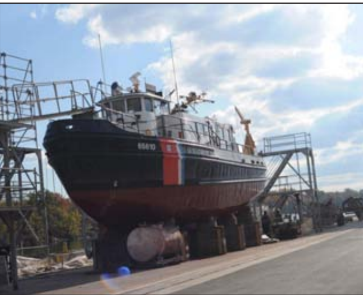
CGC HAWSER (WYTL 65610) - Bayonne, New Jersey