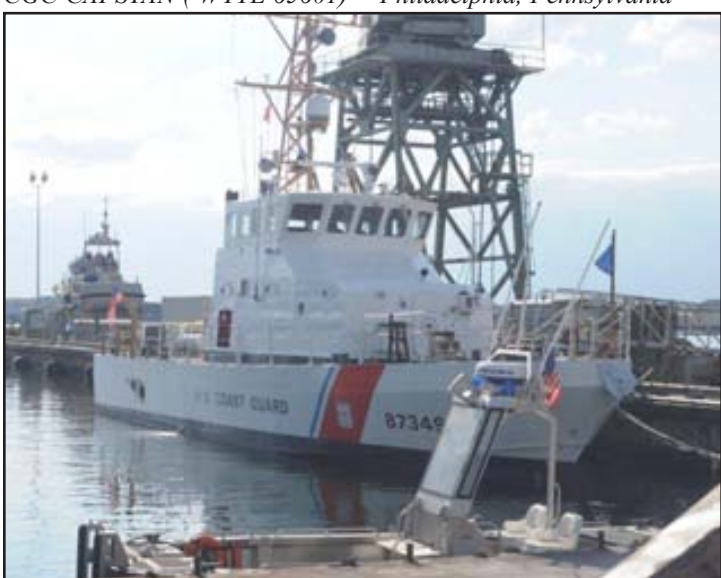
CGC SHEARWATER (WPB 87349) - Portsmouth, Virginia