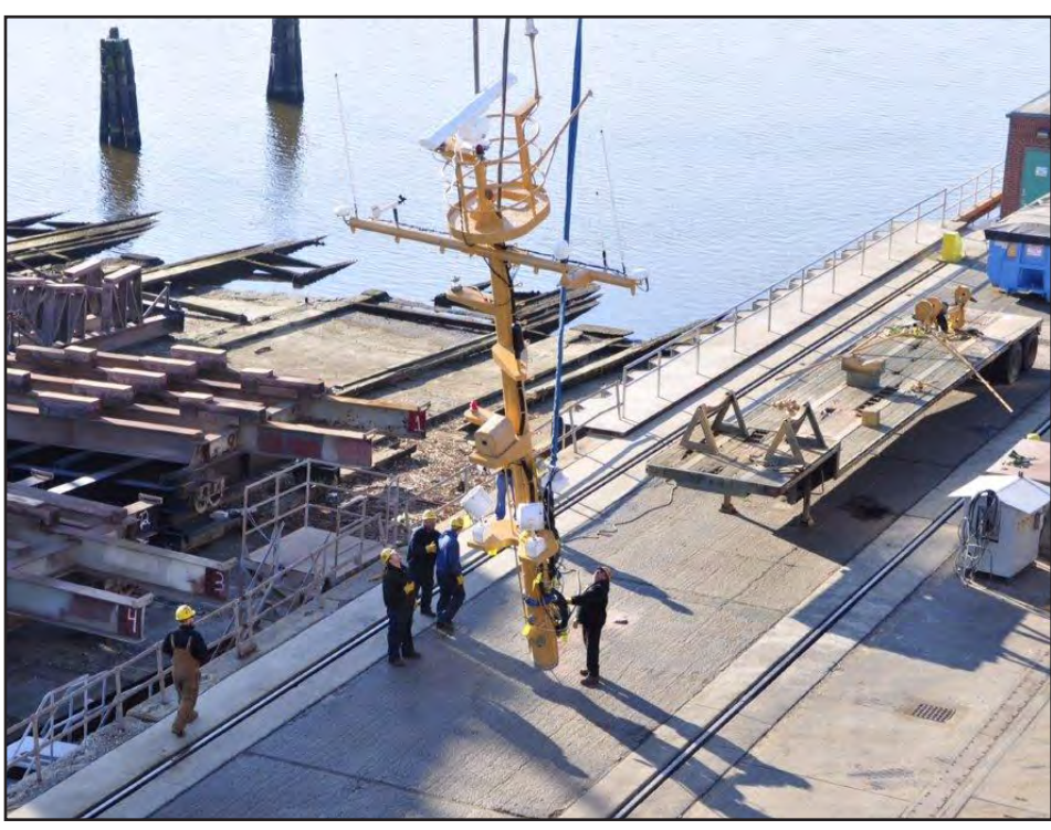
Yard personnel lift the PENOBSCOT BAY's mast to begin fitting.

The PENOBSCOT BAY (WTGB 107), commissioned in 1985, arrived at the Yard in February 2015 for an anticipated 14-month overhaul under the Coast Guard's In-Service Vessel Sustainment Project (ISVS). Wrapping up ISVS repairs this spring, the icebreaking tug will return to its homeport in Bayonne, New Jersey. The cutter's warm weather missions include law enforcement, search and rescue, aids to navigation, cadet training, and port, waterways, and coastal security. During the winter months, PENOBSCOT BAY conducts icebreaking operations on the Hudson River to assist commercial ship and barge traffic as far north as Albany, New York.