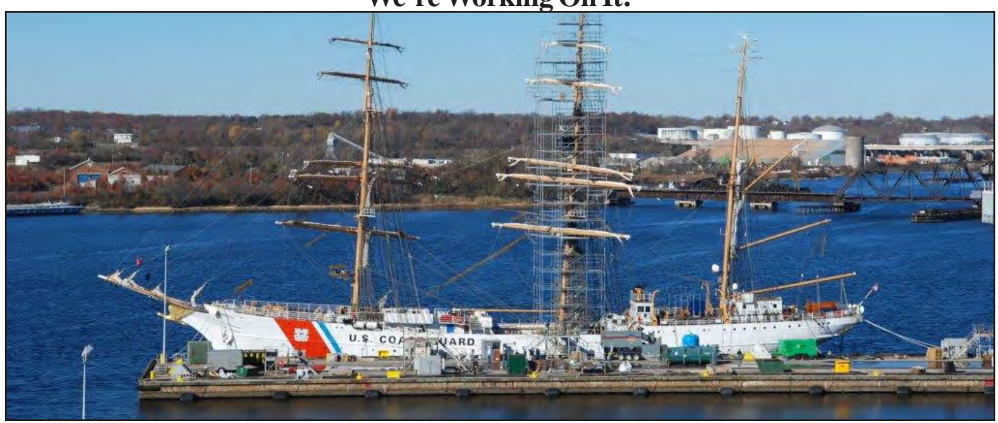
Barque EAGLE (WIX 327) - Baltimore, MD