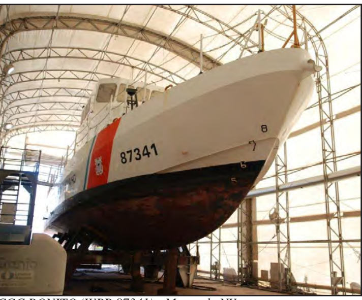
CGC BONITO (WPB 87341) - Montauk, NY