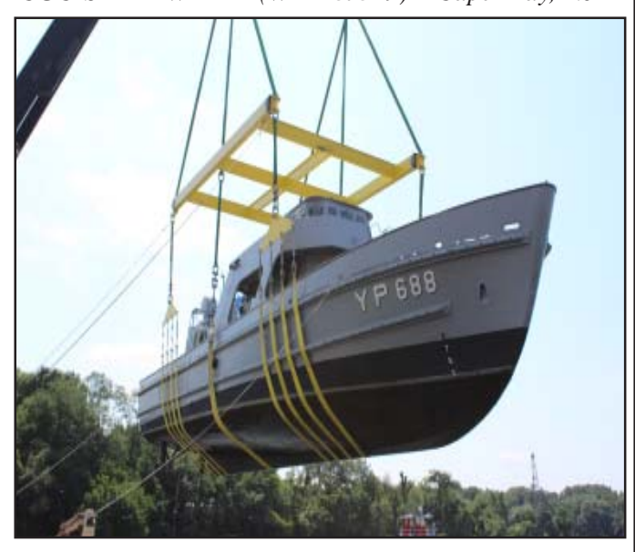
U.S. Navy Yard Patrol (YP 688) - Annapolis, MD