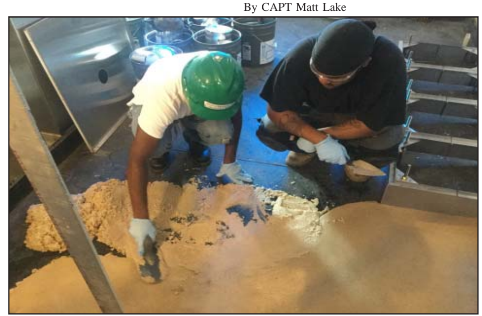
A New Era Academy student intern (left) works with a Yard tradesman (right) to learn decking installation during the 2017 summer internship at the Yard.

The Yard's first program involved hiring apprentices through regional trade schools. This program was successful, but was resourced outside the Yard's working capital fund – and therefore unsustainable as budgets were trimmed. The second program entailed hiring new employees and paying them to take trade classes through a local community college, while simultaneously providing job training. This program was successful in developing new employees, but was expensive ($50,000/person), and paid for out of the Yard's working capital fund – adversely impacting the Yard's labor rate. Both programs failed to adequately improve diversity in the