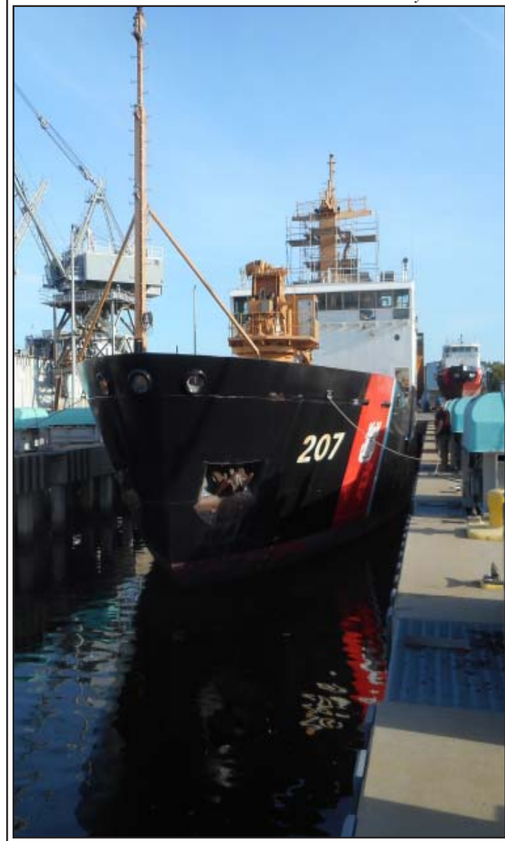
CGC MAPLE (WLB 207) - Atlantic Beach, NC