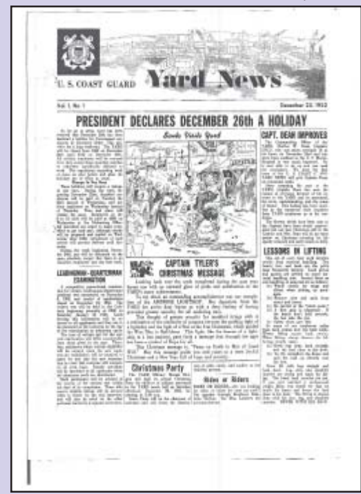
The Yard published the first edition of the "Yard News" on December 23, 1952.

Over the past 65 years, your readership of one of the Coast Guard's oldest internal newsletters has been invaluable. The "Yard News" is an informative voice for the Yard, and as it says in the Volume 1, Number 1 edition, "We hope you like it!" **Editor, Yard News**