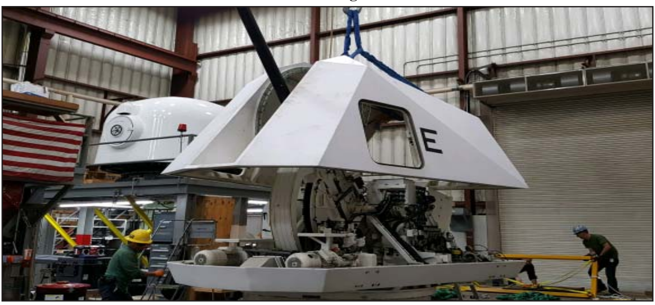
National Security Cutter's MK 110 57mm gun overhaul