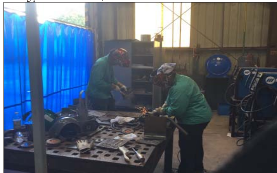
Yard employees undergo training and practice welding skills using the Yard's welding training booths.

In May 2017, the Yard began hosting interns from New Era Academy, a See Recruiting , pg 8