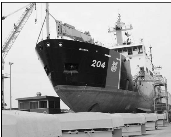
CGC ELM Homeport: Atlantic Beach, North Carolina

The electricians are removing and replacing wiring as needed and assisting with mizzen mast interference cable removal.