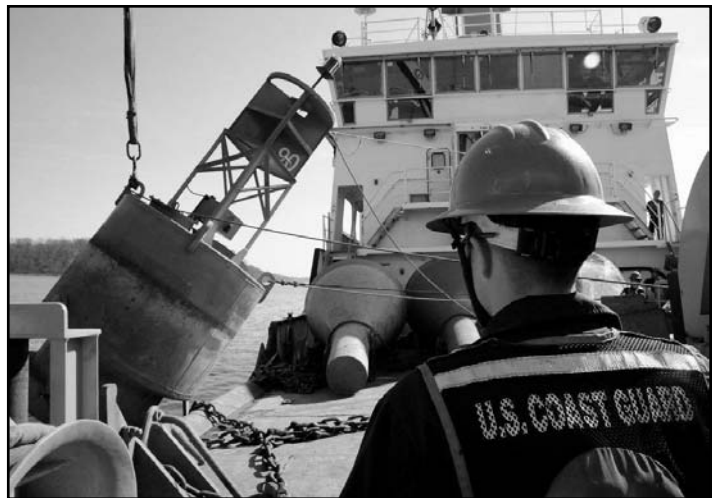
The crew of FRANK DREW works buoys in the Cutter’s area of responsibility.