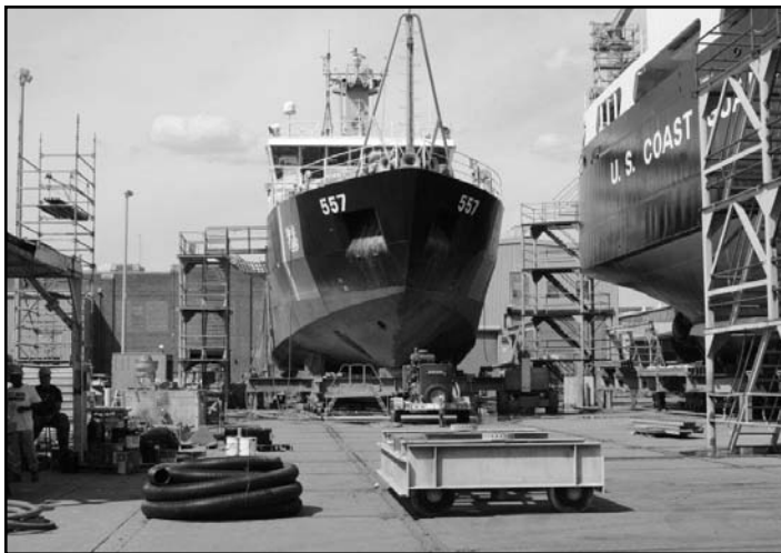
The Cutter FRANK DREW is positioned on the Yard’s shiplift for routine repairs on June 27th.

The Coast Guard Cutter FRANK DREW is a multi-functional buoy tender that services aids-to-navigation from Hampton Roads, Virginia, to Organ Inlet, North Carolina, to Washington, DC and conducts domestic icebreaking, search and rescue missions, and oil spill recovery assignments for the U.S. Coast Guard.