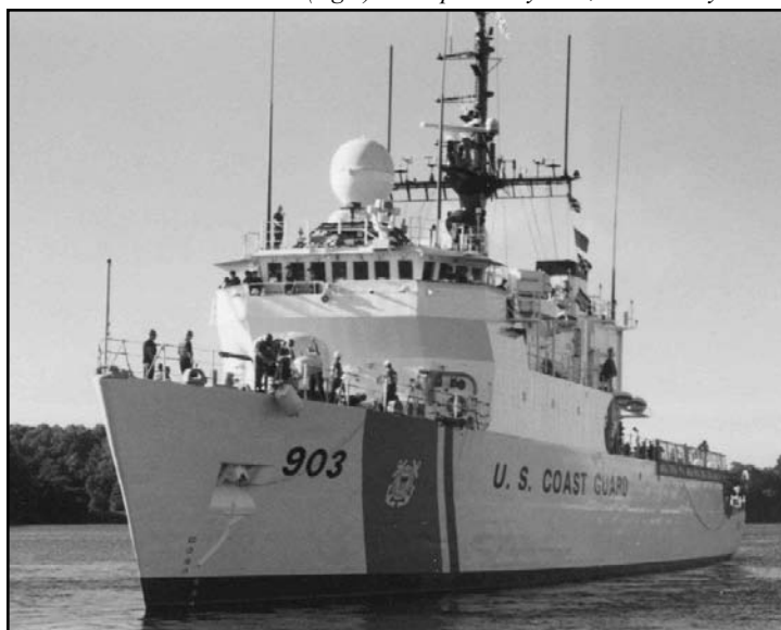
CGC HARRIET LANE Homeport: Portsmouth, Virginia