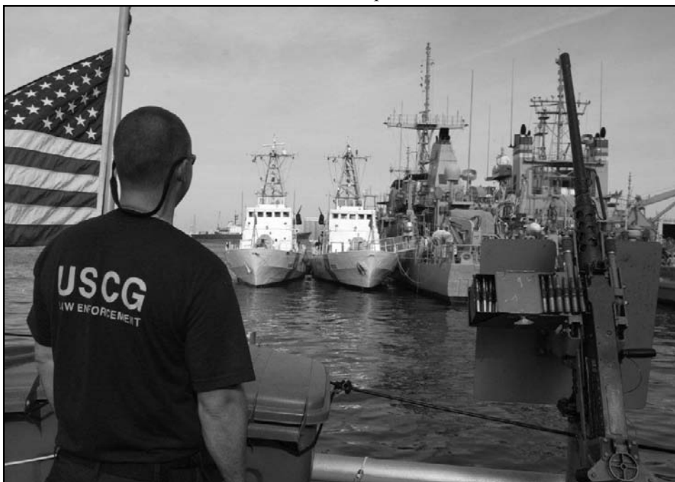
A U.S. Coast Guardsman looks out at the pier shortly before ADAK's (pictured center left) first overseas patrol in 2003. ADAK and its 22-member crew have been deployed to the Middle East for the past nine years. The cutter's homeport is Highlands, New Jersey.