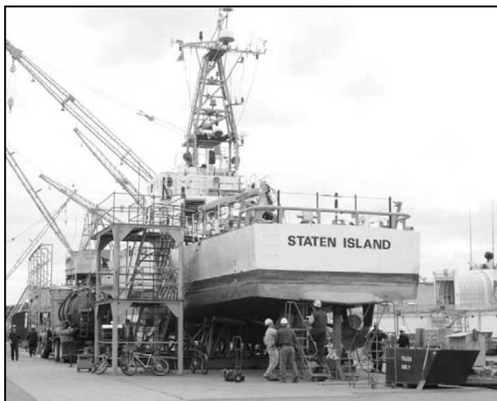
CGC STATEN ISLAND Homeport: Atlantic Beach, North Carolina