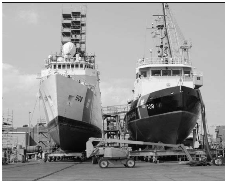
CGC TAHOMA (left) Homeport: Portsmouth, New Hampshire CGC STURGEON BAY (right) Homeport: Bayonne, New Jersey