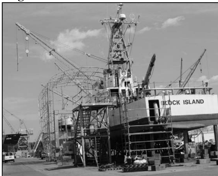
CGC BLOCK ISLAND Homeport: Atlantic Beach, North Carolina