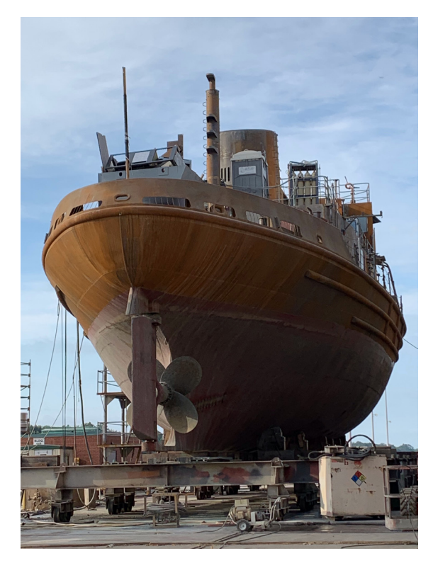
USCGC Biscayne Bay arrived in July 2019 for its planned $16M Service Life Extension (SLEP). This is the last of nine In-Service Vessel Sustainment (ISVS) projects for the SLEP of 140' Icebreaking Tugs (WTBG) at the CG Yard. The primary objective of the 140' Icebreaking Tug (WTGB) SLEP is to restore mission readiness and extend the service life of this nine cutter fleet by approximately 15 years.