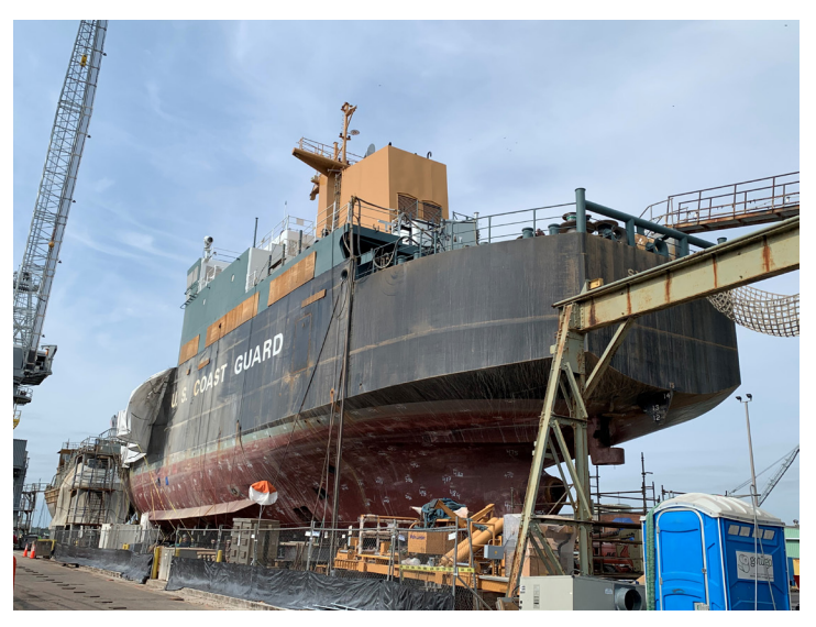
USCG Cutter Sycamore arrived at CG Yard in April 2019 for its scheduled Midlife Maintenance Availability (MMA). Pictured here shows recently completed low pressure blasting and Ultrasonic Testing (UT) which is a weld inspection testing of the metal to measure its thickness.