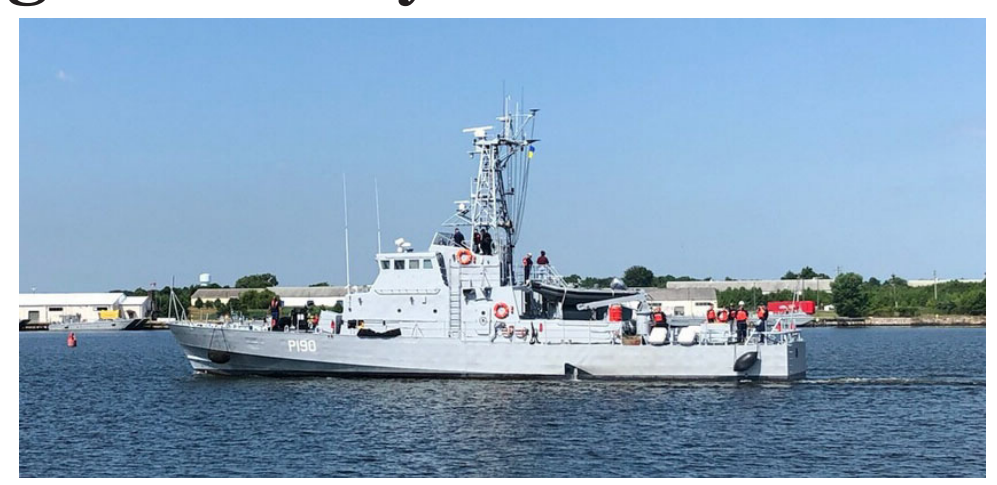
Pictured are completed vessels at sea trials.

The Coast Guard YARD (CG Yard) successfully reactivated two decommissioned 110' Island Class WPB's to support the U.S. government's support to the nation of Ukraine. These types of availabilities are the kind of challenge CG Yard exists for! The amount of work required to get the vessel functional is difficult to predict, because the ships have been inactive for a long period of time. CG Yard's experience with the 110's dates back to early 2000's when the year-long Mission Effectiveness