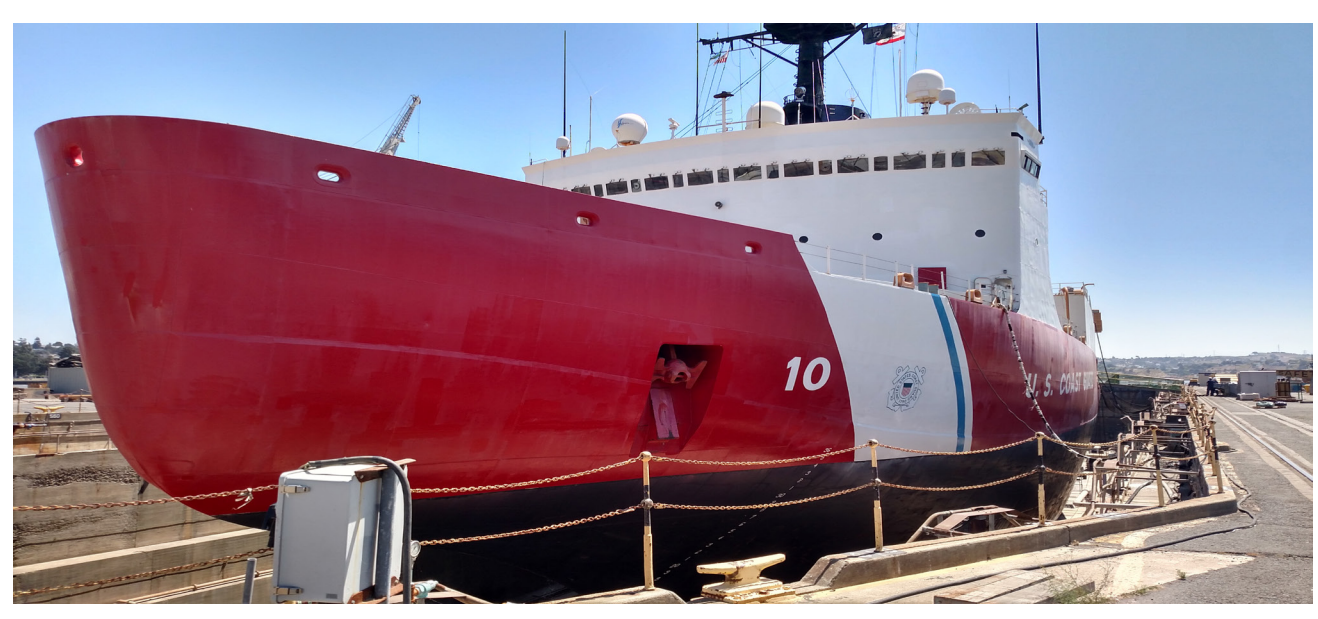
USCGC Polar Star in dry dock in Sacremento, CA in early August. A Yard team consisting of two electricians, a welder/fitter and a safety members performed a site survey to check for lead paint and asbestos interferences in preparation for potential future work. CG Yard is honored to support the mission of the Polar Star by taking this first step initiating its five year SLEP. Polar Star works to provide a clear channel through Antarctic ice for resupply ships to reach the National Science Foundation's McMurdo Station.