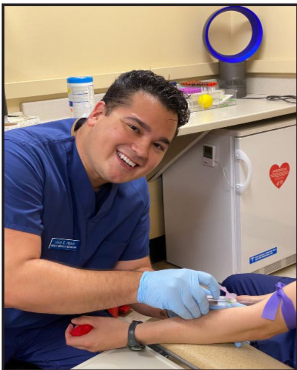
HS2 Eduardo Pena Health Clinic