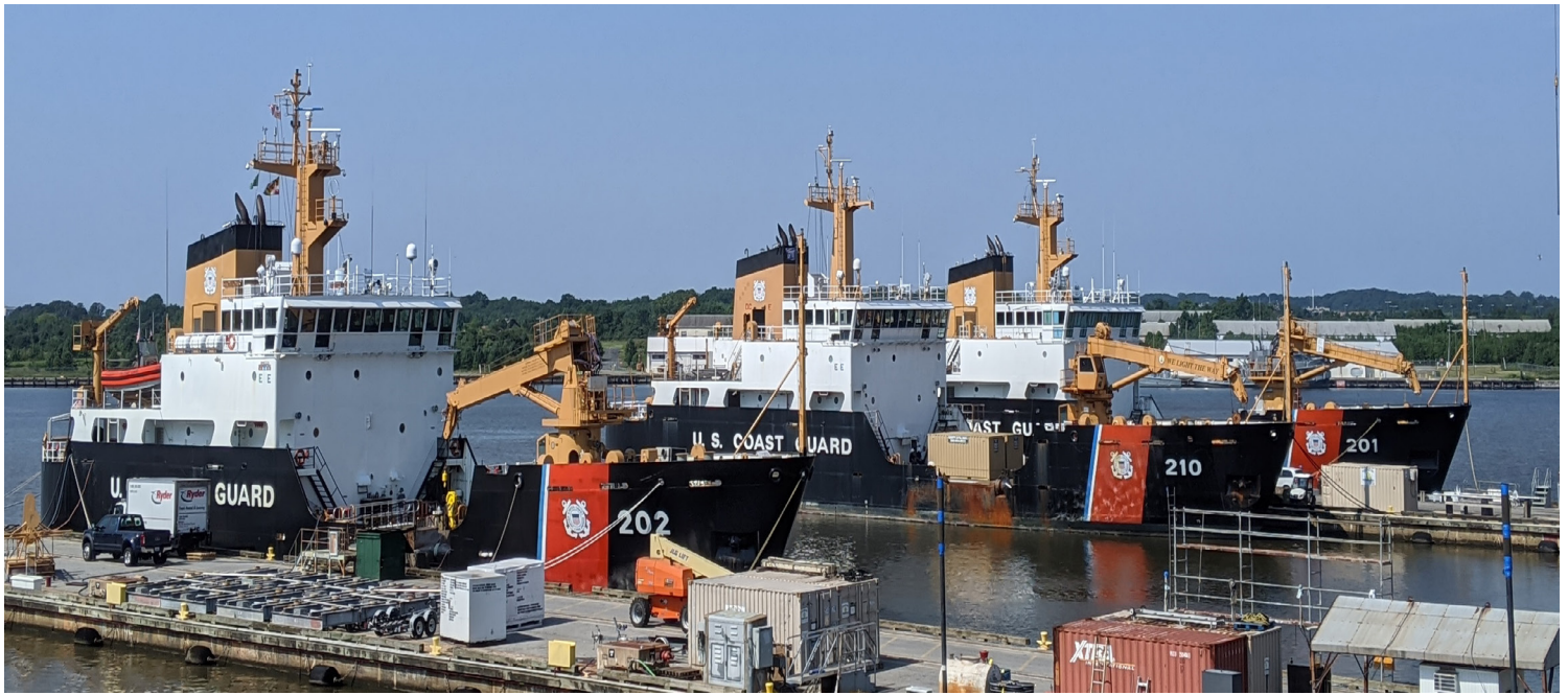
Above Left: 225' CGC 's Willow, Cypress and Juniper on the CG Yard waterfront.

In mid-August the CG Yard undocked the eighth of sixteen 225' hulls to undergo a Major Maintenance Availability (MMA). The first and primary phase of the MMA began in 2015, with CGC Oak and CGC Willow, and is scheduled to end in 2024 with CGC Hollyhock. You may be asking yourself "Why is CGC Willow back at the CG Yard?" When the project began, several equipment upgrades were not available, but now those upgrades can be completed. CGC's Oak and Willow are scheduled for "Phase 2" work that will include major upgrades to the Aids to Navigation (AToN) Crane, the Heating, Ventilation and Air Conditioning (HVAC), and refrigeration systems, among others. This MMA program is successful because of diverse skills and services available at the CG Yard; our workforce takes great pride in their work, and it shows!