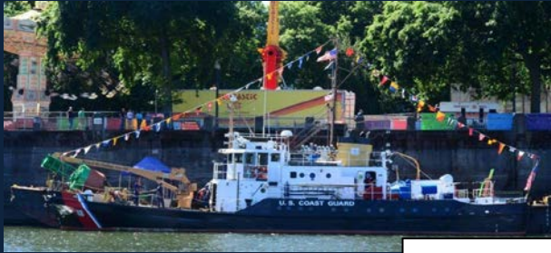
(1) 100-Foot WLI (1945) BLUEBELL

LENGTH: 100 feet BEAM: 24 feet FULL LOAD DRAFT: 4 feet SPEED: 12 knots RANGE CRUISING: 2,700 nm LIFT: 10,000 lbs COMPLEMENT: 15