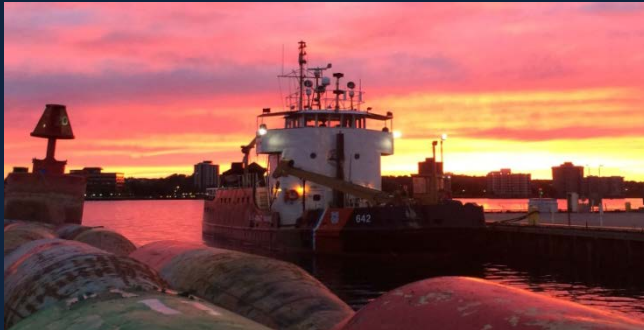
(1) 100-Foot WLI (1963) BUCKTHORN