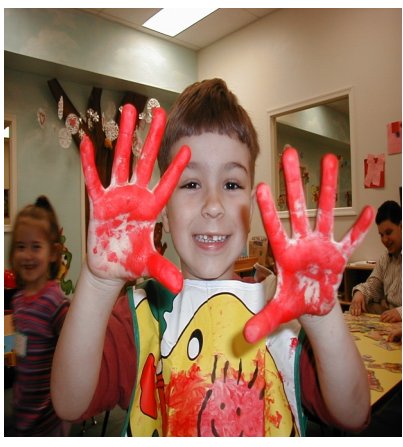
Northeastern Carolina Child Care Resource and Referral (CCR&R)

Enabling families, practitioners and communities to recognize, support and access high quality, affordable child care