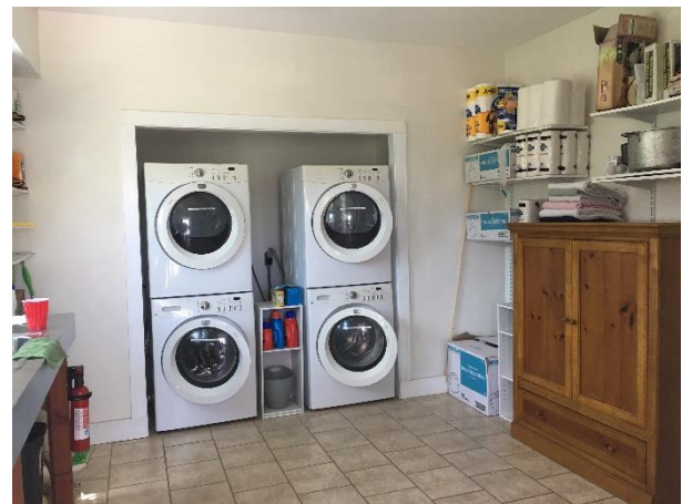
Shared Laundry Area