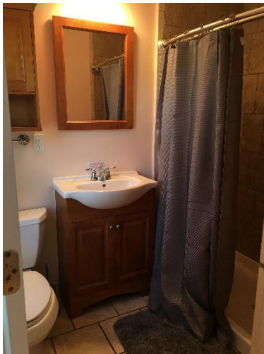
Lower Unit Bath