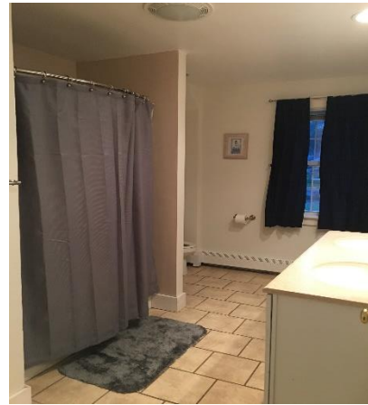
Upper Unit Bath