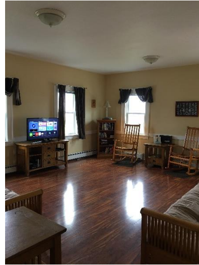
Lower Unit Living Room