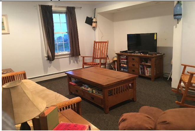
Upper Unit Living Room