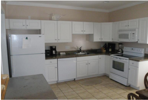
Lower Unit Kitchen