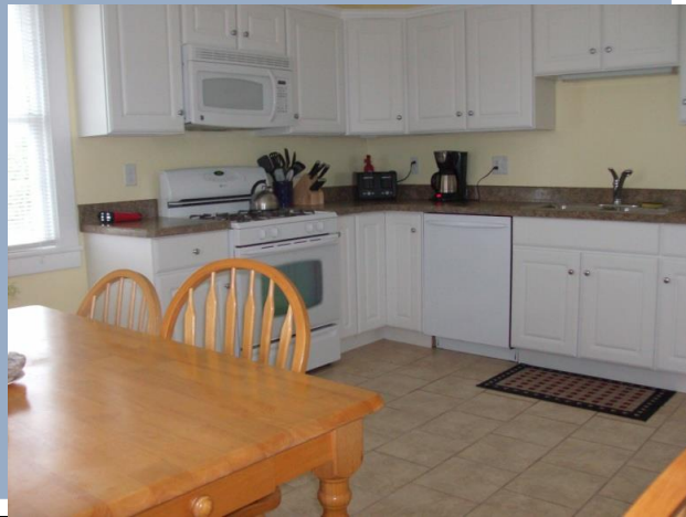
Upper Unit Kitchen