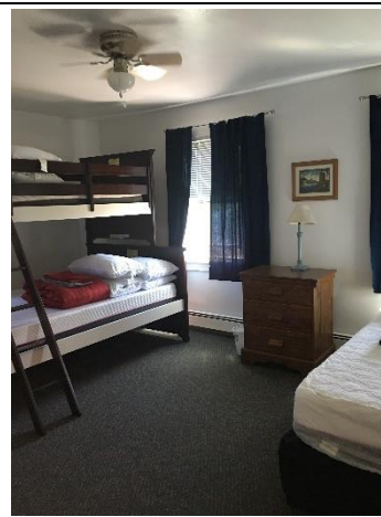
Upper Unit Triple Room (one set of bunk beds and a single bed)