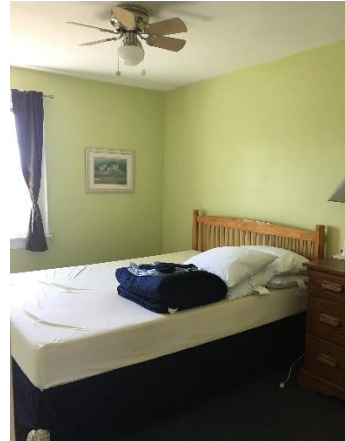
Upper Unit Double Room