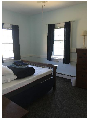
Lower Unit Double Room