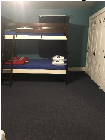
Upper Unit Quad Room (2 sets of twin over full bunk beds)