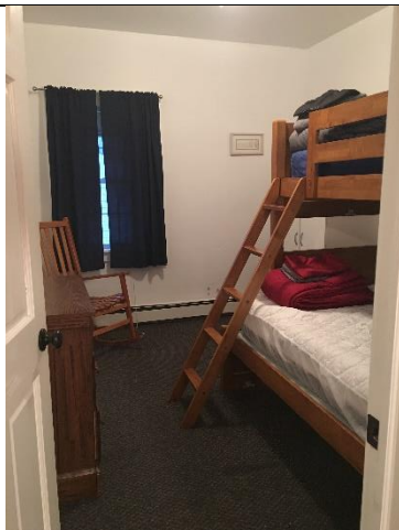
Lower Unit 2 nd Room