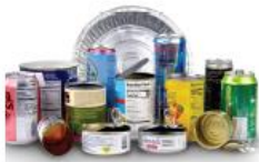
Food and Beverage Cans empty and rinse