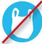
No Plastic Bags or Plastic Wrap (return to retail)