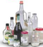
Bottles and Jars empty and rinse