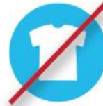
No Clothing or Linens (use donation programs)