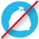
Do Not Bag Recyclables No Garbage