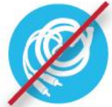
No Tangles (no hoses, wires, chains or electronics)