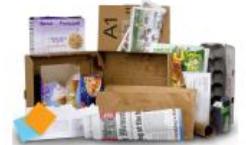
Mixed Paper, Newspaper, Magazines, Boxes empty and flatten