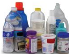
Bottles, Jars, Jugs and Tubs empty and replace cap