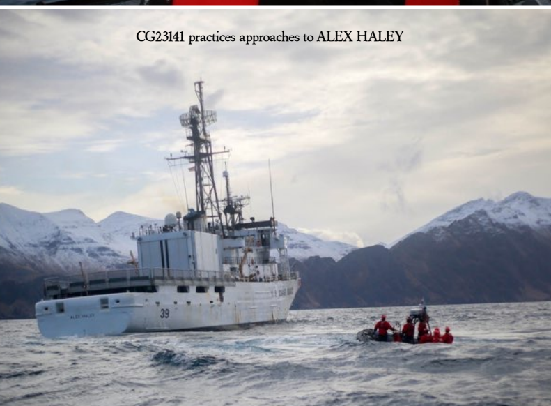
CG23141 practices approaches to ALEX HALEY