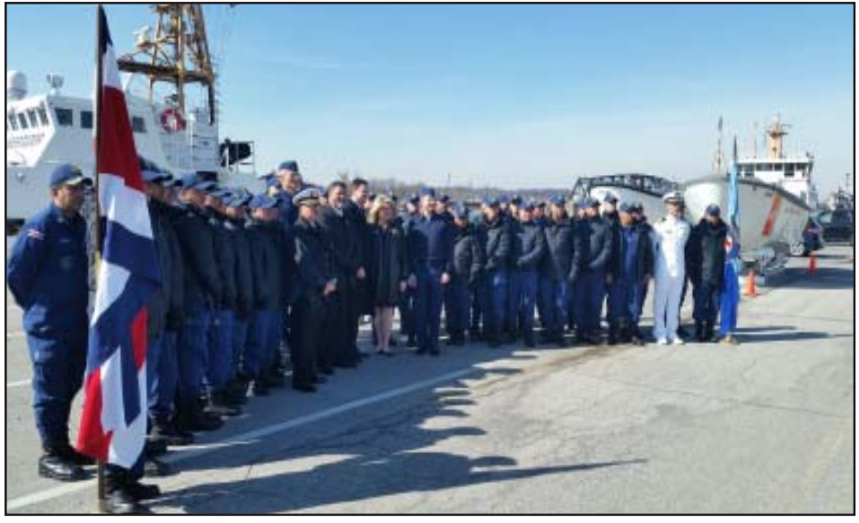
U.S. Coast Guard instructors from APO Baltimore provide training to the Costa Rica crews of the Libertador class vessels Juan Rafael Mora Porras and General Jose Maria Canas Escamilla for 10 weeks during January, February and March before the decommissioned U.S. Coast Guard 110' patrol boats set sail for their new homeport in Costa Rica, Central America.

The U.S. Coast Guard foreign military sales program helps build and sustain international partnerships in support of the U.S. Coast Guard's national maritime strategy promoting regional and global maritime safety and security. This includes a commitment to interdict narcotics, combat organized crime, and prevent illegal fishing, among other illegal activities.