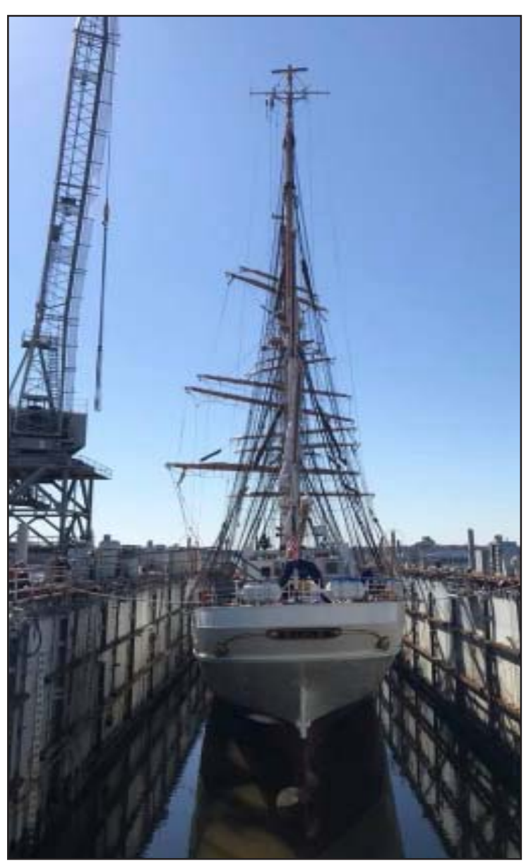
EAGLE departs OAKRIDGE as the Coast Guard's training vessel gets ready to conclude a 4-year modernization at the Yard and prepare for the 2018 summer ports of call.

The Yard has been EAGLE's homeport throughout the four-year SLEP and, upon the tall ship's departure, wishes its officers and crew "Fair Winds and Following Seas."