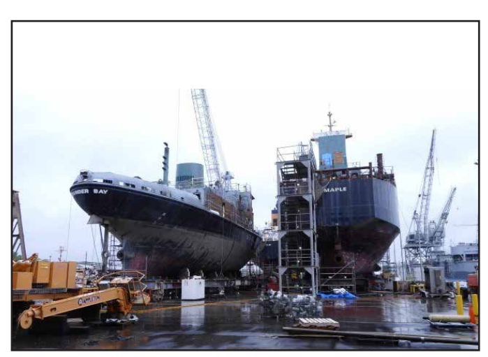
CGC THUNDER BAY (left) (WTGB 108) - Rockland, ME CGC MAPLE (right) (WLB 207) - Atlantic Beach, NC