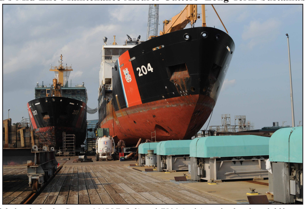
The Yard's shiplift dry docks the Cutters MAPLE (left) and ELM (right) as the fourth and fifth, respectively, 225' buoy tenders to undergo mid-life repair under the Coast Guard's In-Service Vessel Sustainment program.