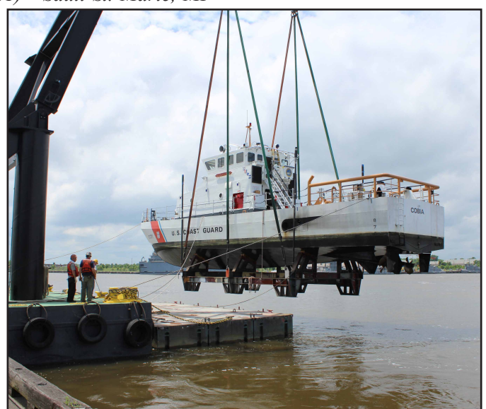
CGC COBIA (WPB 87311) - Woods Hole, MA