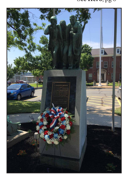
Memorial Day 2018