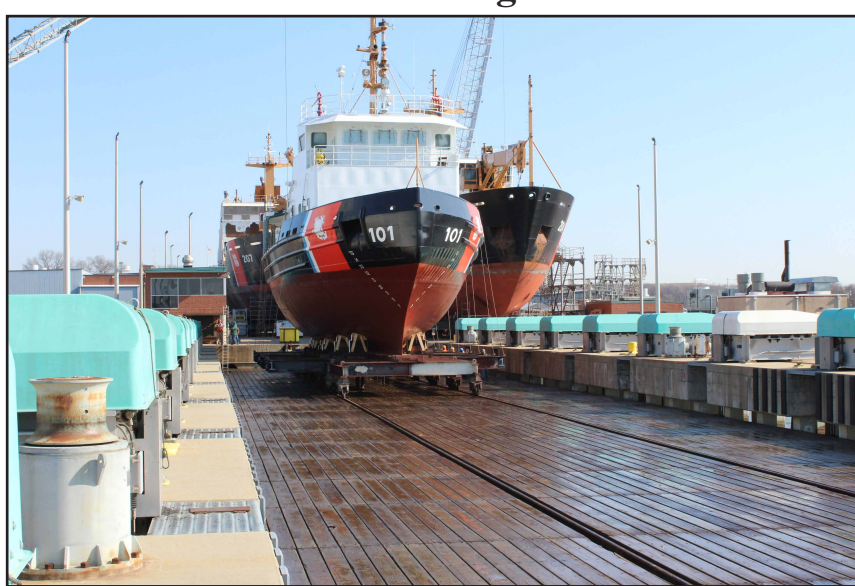
CGC KATMAI BAY (WTGB 101) - Sault St. Marie, MI