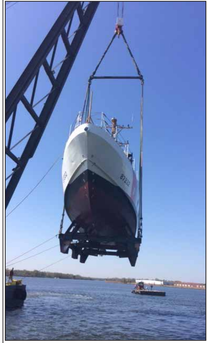
CGC RAZORBILL (WPB 87332) - Portsmouth, VA